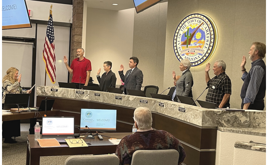
Swearing in of Town Councilmembers